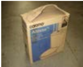
✓ Re-taping required