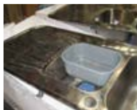
✗ Installed Product