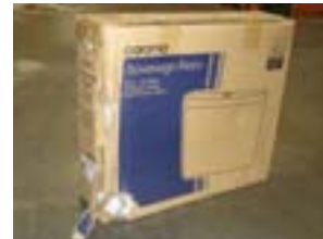
✗ Significant carton damage requiring re-packaging