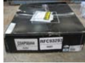
✗ Packaging covered with non GWA labels