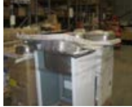
✗ Damaged product with no packaging