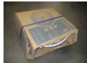
✗ Torn or destroyed packaging