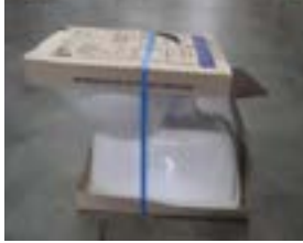
✓ Re-taping required