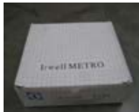
✓ Minor creasing