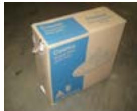
✓ Re-taping required, minor carton damage