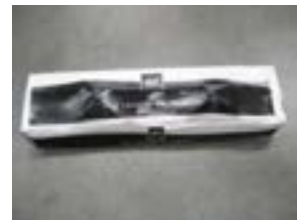
✗ Significant creasing, Re-packaging required