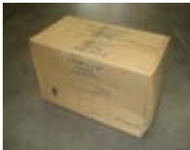
✓ Minor creasing