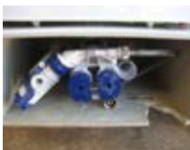
✗ Modified Product