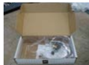
✗ Missing Components