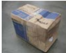
✗ Major creasing, Re-packaging required